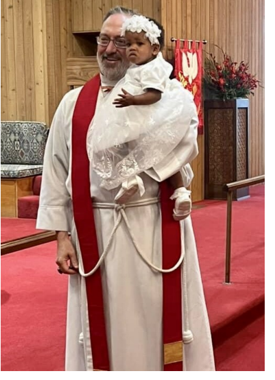
"We receive you into the household of God."