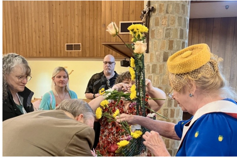
Flowering of the Cross at the 10:00 service.