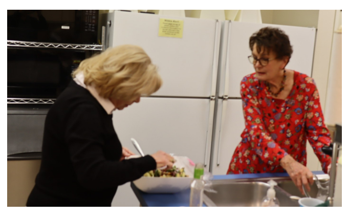
Preparing the feast to go with the Tamales!