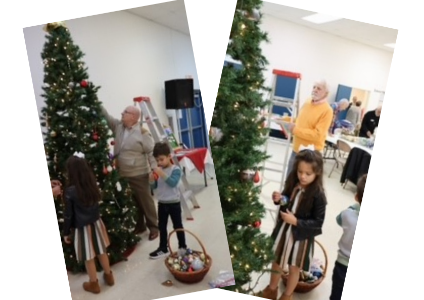
Decorating the parish hall tree