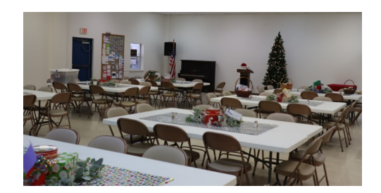
The hall is ready for the meeting, breaking bread, & decorating!