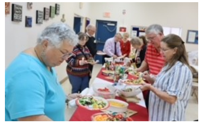
So much yumminess to choose from!